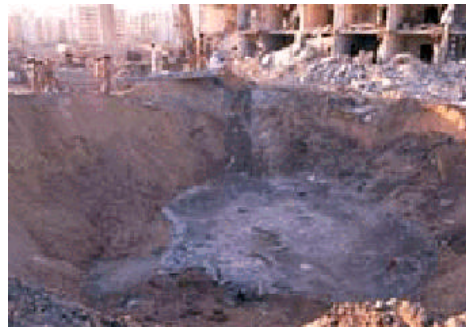
85-foot deep blast crater

Estimates of the size of the bomb range from the equivalent of 3,000 to more than 30,000 pounds of TNT. The Task Force estimated that the bomb was between 3,000 and 8,000 pounds, most likely about 5,000 pounds. While U.S. Air Force Security Police observers on the roof of the building overlooking the perimeter identified the attack in progress and alerted many occupants to the threat, evacuation was incomplete when the bomb exploded. Nineteen fatalities and approximately 500 U.S. wounded resulted from the attack.