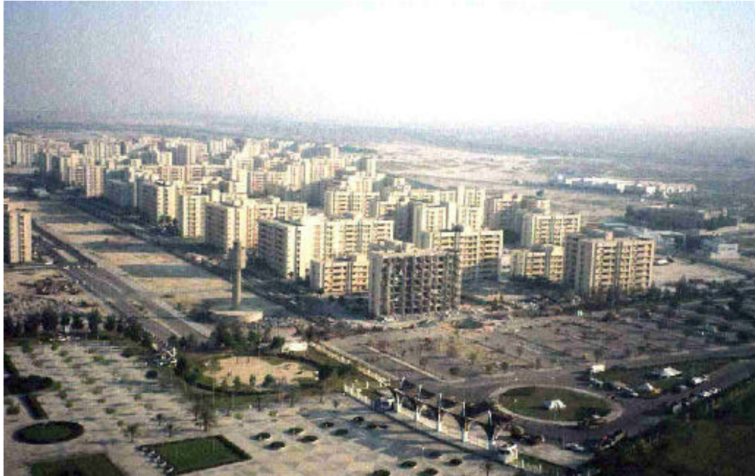
Aerial view of the Khobar Towers Complex