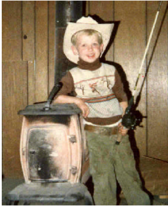
Goin fishin 1979