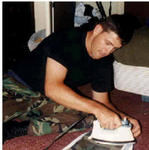
Getting ready for duty