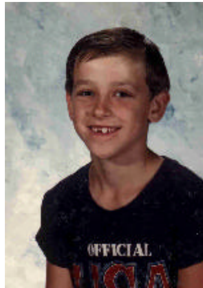
1983 Third Grade