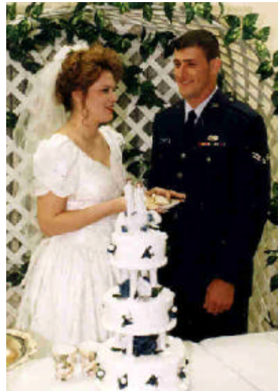
The wedding cake