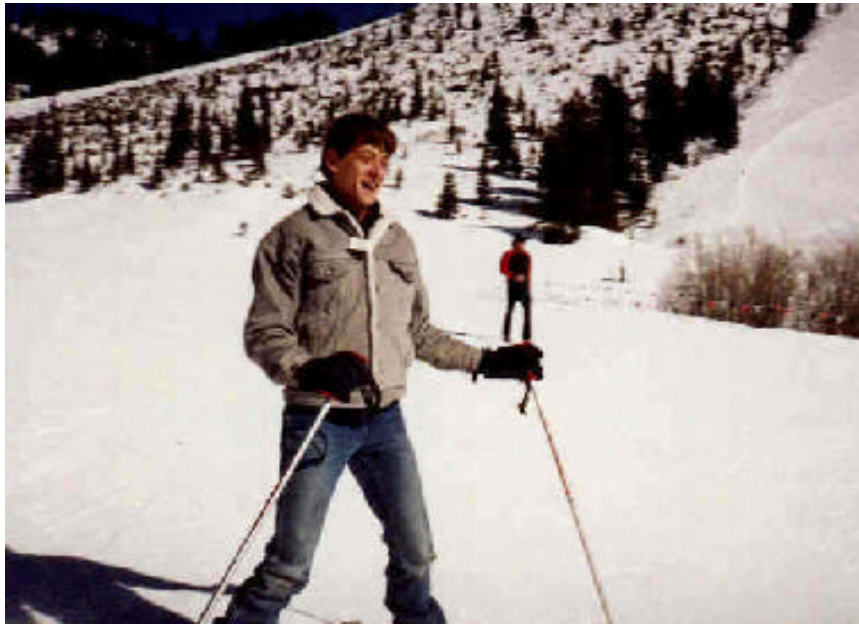
Learning to ski at Mt. Shasta, 1990